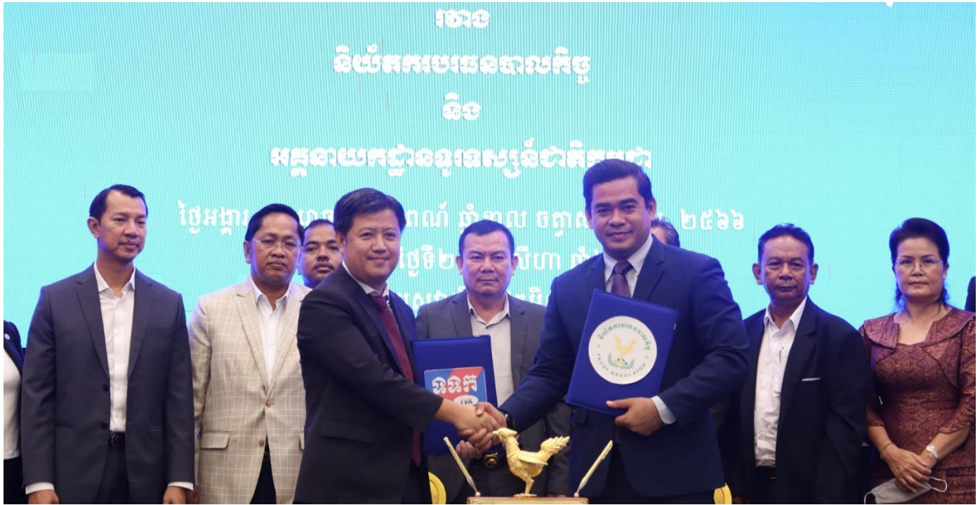
Picture of MoU on "Cooperation on Raising Public Awareness and Promoting Participation in the Trust Sector in the Kingdom of Cambodia" between Trust Regulator and National TV of Cambodia