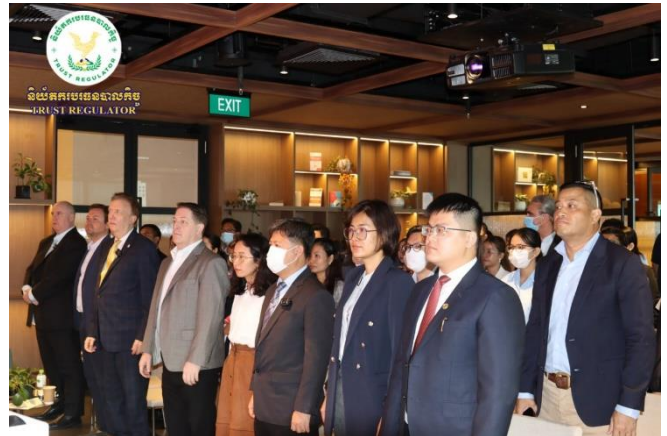
Picture of the inter-departmental meeting to review the achievements for July and August, and action plans for September 2022

workshop is organized for the purpose of disseminating the Law on trust and tax-related topics in the trust sector from countries in the region and in Cambodia. The workshop was attended by a total of 100 participants, including leaders of real estate companies, banks, lawyers' offices, trust companies, insurance companies and educational institutions.