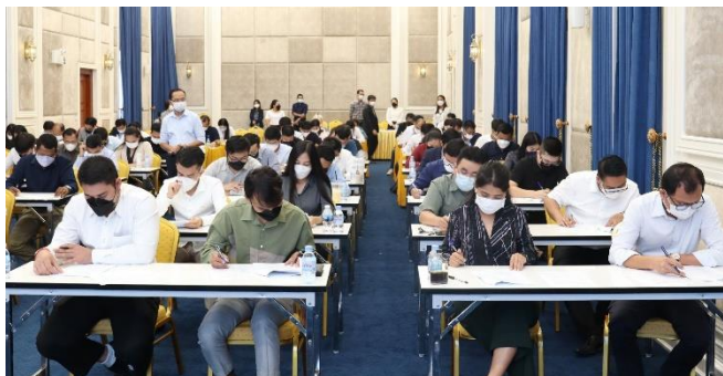
Picture of the first examination for approved persons in the trust sector of 2022 for the group 3

The first examination for approved persons in the trust sector of 2022 for the group 3, which took place on the morning of Friday, August 12, 2022 at the building of the Non-Bank Financial Services Authority (FSA).