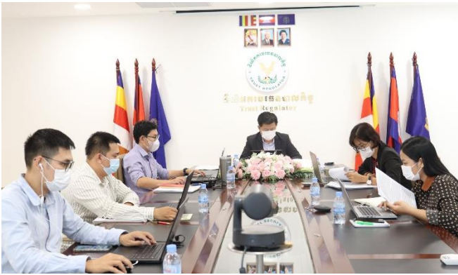
Picture of a technical meeting of the FSA to review and give comments and inputs of the Draft Prakas on Investment Guidelines for Insurance Companies of the Insurance Regulator of Cambodia