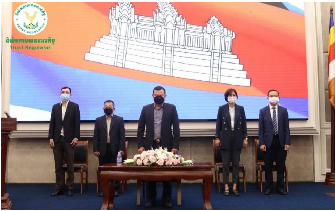
Picture of the opening of "the 1st Training Program and Examination for Approved Persons in the Trust Sector of 2022" for Group 2