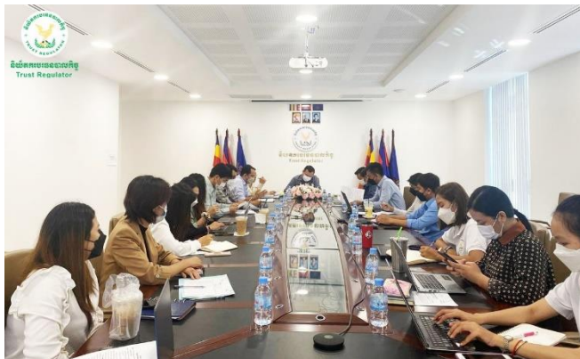
Picture of the inter-departmental meeting to review the achievements for July and August, and action plans for September 2022