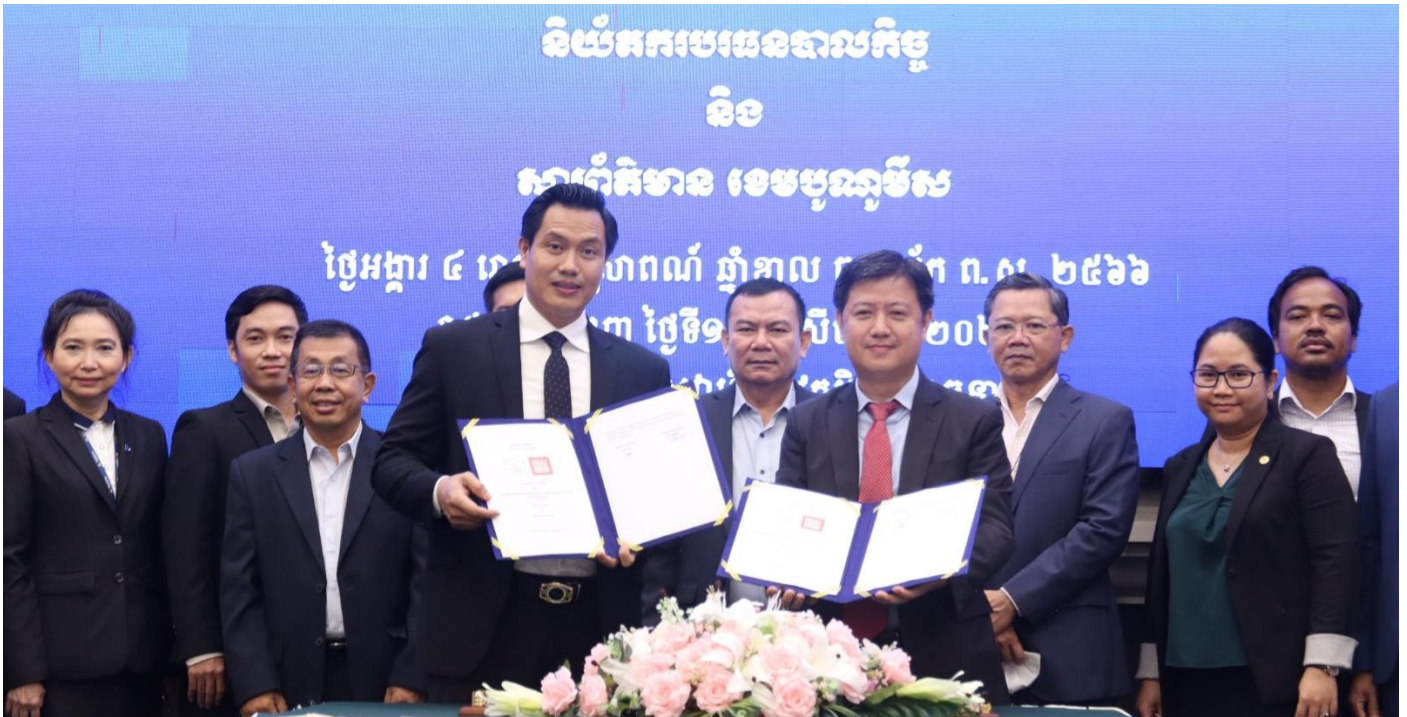
Picture of MoU on "Cooperation on Raising Public Awareness and Promoting Participation in the Trust Sector in the Kingdom of Cambodia" between Trust Regulator and Cambonomist

Cambonomist to raise public awareness of the development process of the trust sector in Cambodia, trust mechanism, eligible requirements to do the trust operation, related legal framework, benefits of the trust operation, building and establishing confidence in business and the flow of fund to all sectors in the economy and society. The signing ceremony of the Memorandum of Understanding was attended by representatives of the in-line regulators under the Non-Bank Financial Services Authority (FSA), the management and officials of the TR, the trust company and companies which provide services in the trust sector.