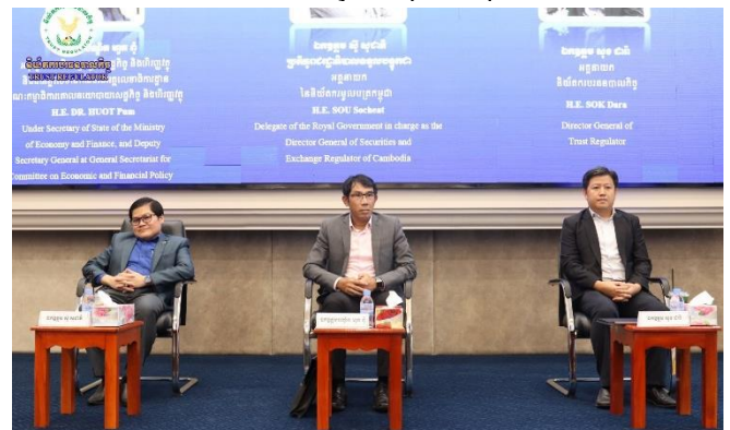
Picture of Capacity building workshop on "Leadership: prosperity, vitality, balance"