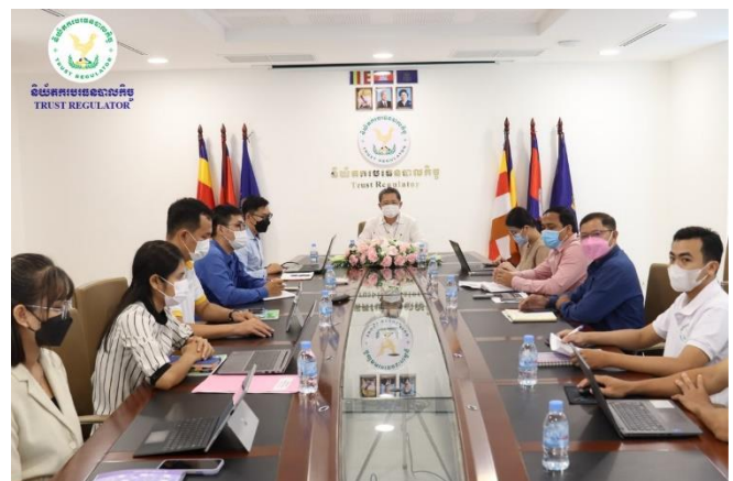
Picture of a meeting regarding work achievements for July 2022 and work guidance for August 2022 of the Trust Registration Department