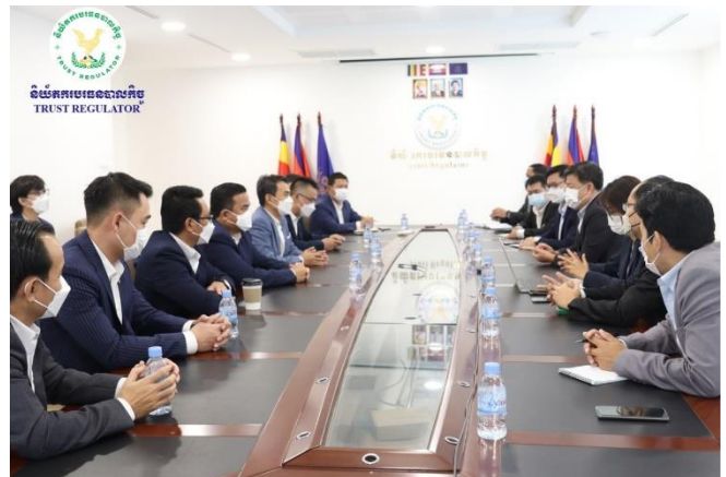
Picture of discussion on the development and investment opportunities in trust sector and to promote the development of the trust sector in Cambodia