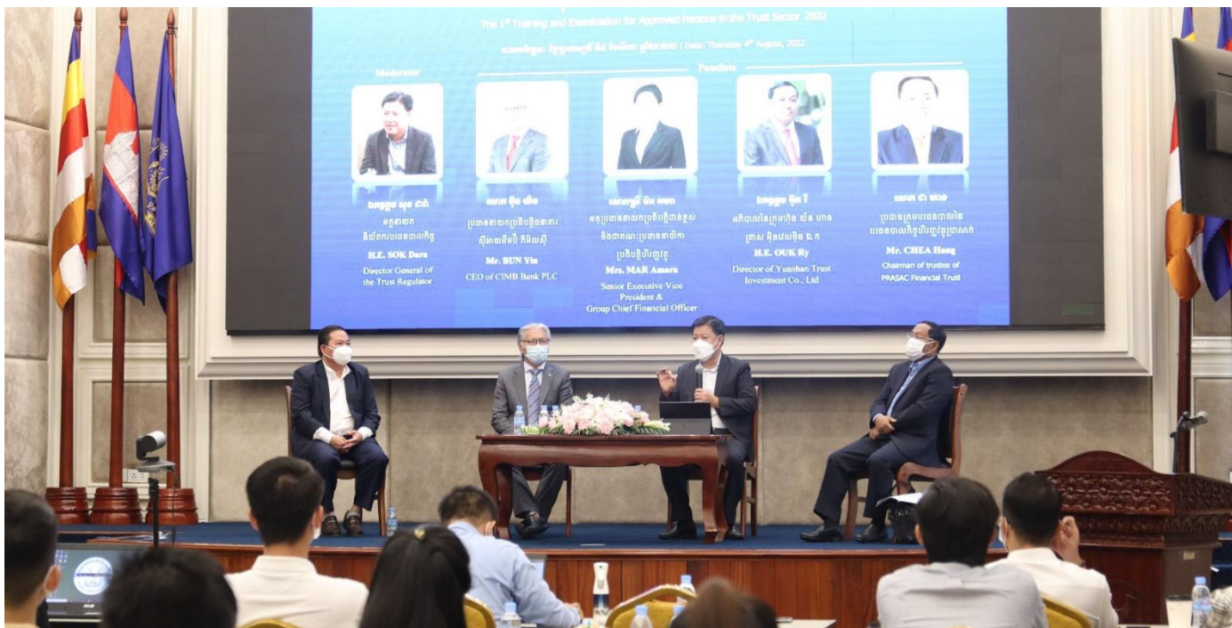
Picture of the Panel Discussion: The Concepts of Development Process of Trust Sector in Cambodia for the second group of the 1st Training and Examination for Approved Persons in the Trust Sector of 2022

the trust sector in Cambodia by sharing the speakers' practical experiences, challenges, opportunities, and experiences of banking sector development as a reflection of the trust sector development process, legal aspects, and practices as well as the potential of the trust sector. Overall, the speakers expressed their appreciation for the development process of the trust sector, including the establishment of the Trust Regulator and the implementation of new regulations, and have a positive outlook on the potential as well as the trust operations that will contribute and promote the development of other sectors in society.