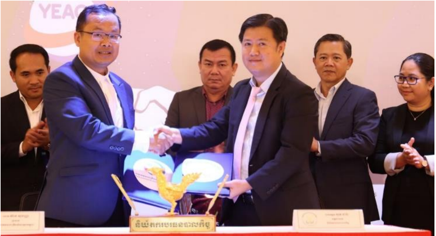
Picture of MoU on "Cooperation on Raising Public Awareness and Promoting Participation in the Trust Sector in the Kingdom of Cambodia" between Trust Regulator and Young Entrepreneurs Association of Cambodia (YEAC)