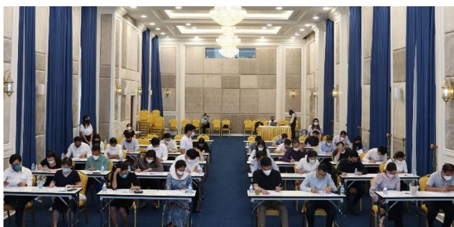
Picture of the first examination for approved persons in the trust sector of 2022 for the group 2

The first examination for approved persons in the trust sector of 2022 for the group 2, which took place on the morning of Friday, August 5, 2022, at the building of the Non-Bank Financial Services Authority (FSA).