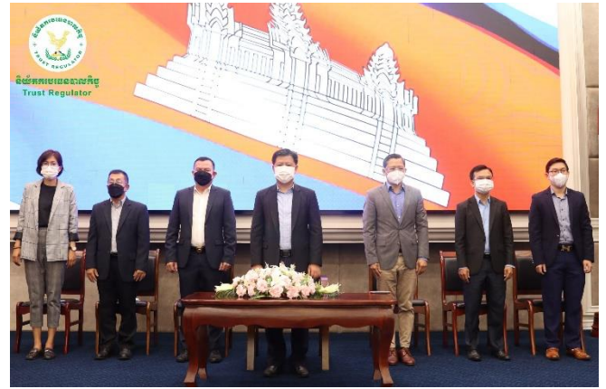
Picture of the opening of "the 1st Training Program and Examination for Approved Persons in the Trust Sector of 2022" for Group 3