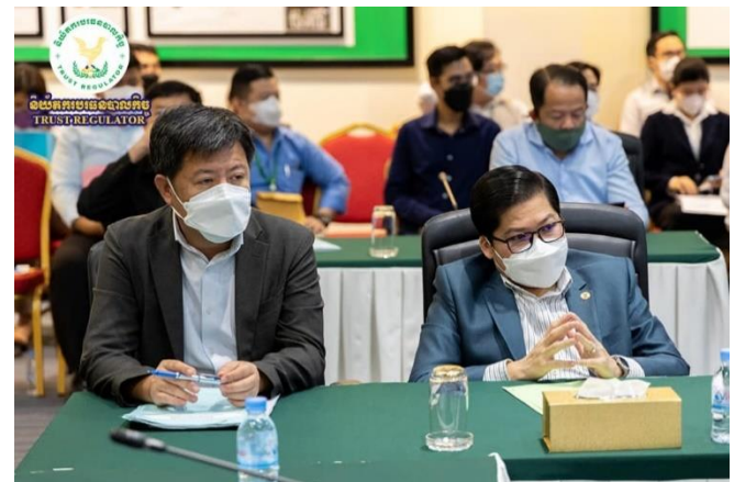
Picture of discussion meeting on the Revenue and Expenditure Budget Plan for the Year 2023 of the Ministry of Economy and Finance