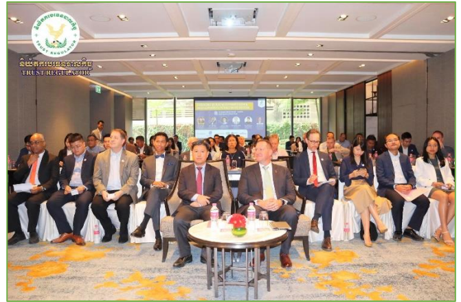
Picture: The workshop concerning Emerging Business Opportunities: Developments in the Trust Sector.

market to raise awareness of the crucial role and benefits of Trust, which is a trusted mechanism for property or asset management and safeguard-keeping.