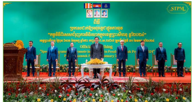
Picture: Special Programme to Promote Investment in Preah Sihanouk Province 2024