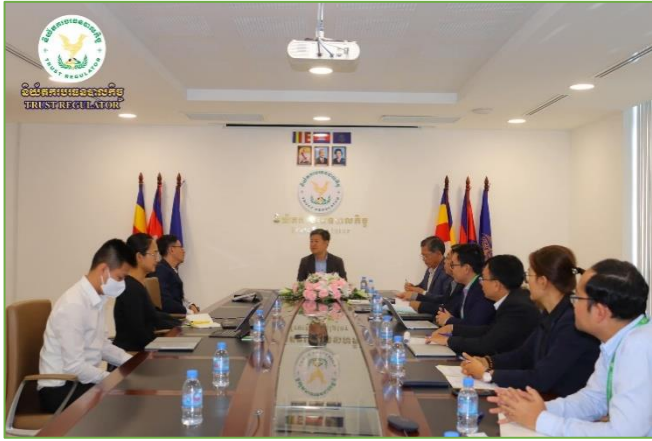
Picture: The meeting between TR and PwC.