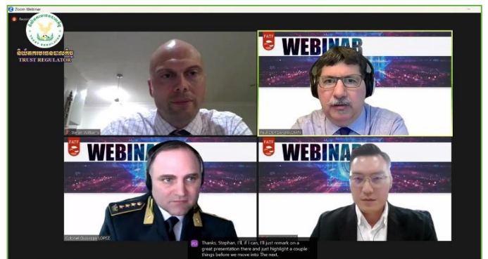
Picture: The Workshop on Parallel Financial Investigations.