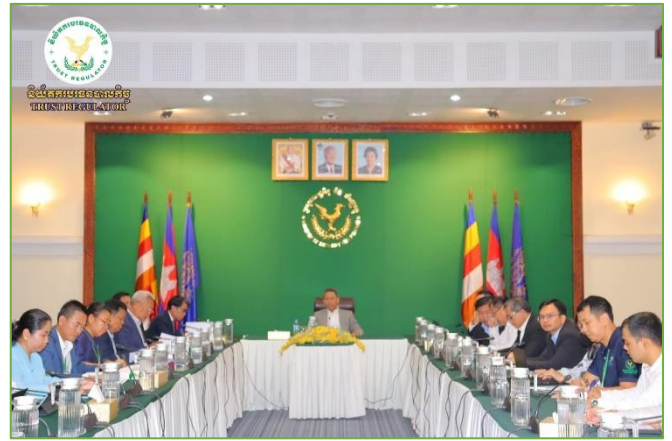
Picture: Disseminating meeting on Implementation of Financial Law for Management 2024.