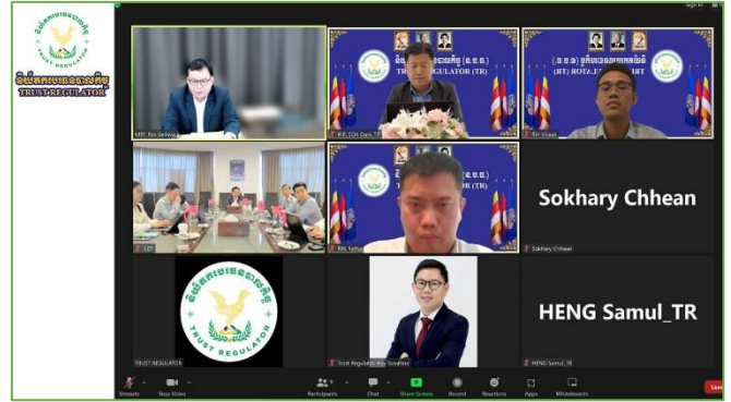
Picture: Meeting of the Working Group Coordinating the Implementation of Regulation related to Taxation in the Trust Sector.