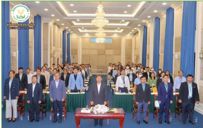
Picture: A dissemination seminar on the implementation of the "PRAKAS on Accreditation of Audit Firm in the Trust Sector".

escrow services, independent individual trustees and audit firms