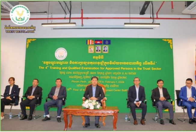
Picture: The 4th Training and Qualified Examination for Approved Persons in the Trust Sector.