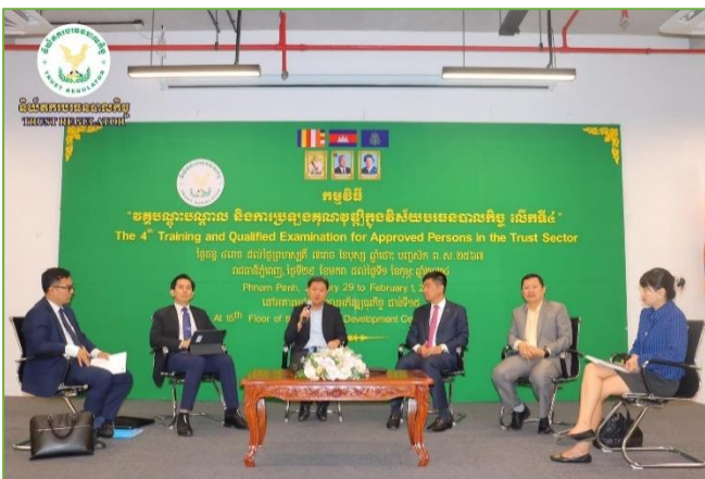
Picture: Panel Discussion: Practical Experience, Challenges and Opportunities of Trust sector in Cambodia.