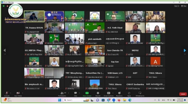
Picture: Meeting to review and discuss the progress report for Q4 of 2023.