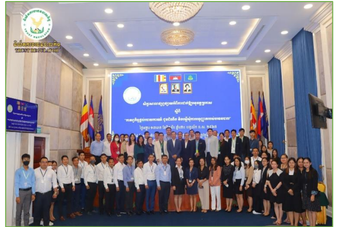
Picture: A dissemination seminar on the implementation of the "PRAKAS on Obligation of Reporting, Notifying and Requesting for Approval of Trustees"