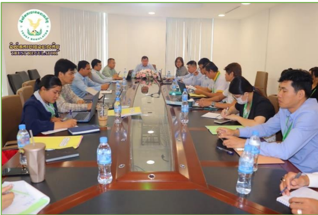
Picture: Inter-department meeting to review the Draft of Trust Regulator's Annual Report 2021-22.