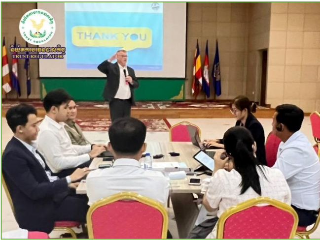
Picture: Workshop on National Risk Assessment on Money Laundering and Financing of Terrorism and Financing (NRA II) for Module 7 and Module 13.