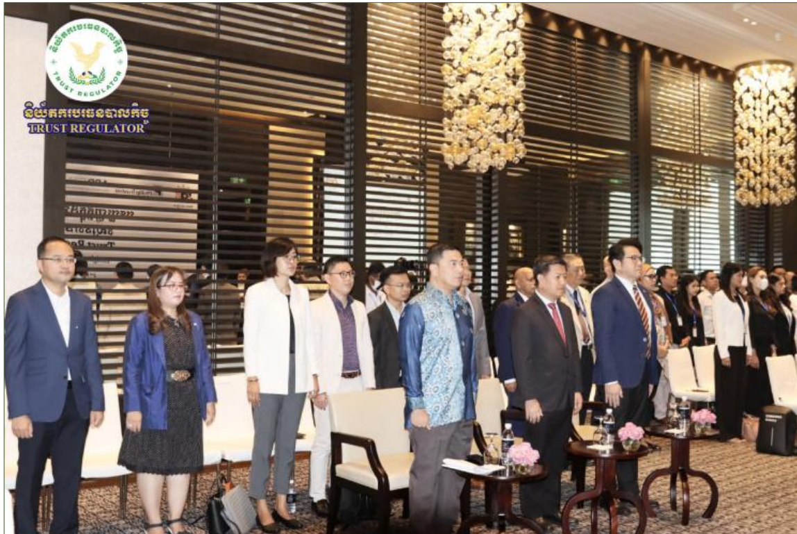
Picture: The seminar on "Trust Regulation in Cambodia: Insights from the Trust Regulator".

Participated in the seminar were top managements and technical official of the TR, chairman/top management of businesses who are members and partners of Malaysian Business Chamber of Cambodia as well as trust companies and stakeholders in the trust sector. The seminar ended with fruitful outcomes.