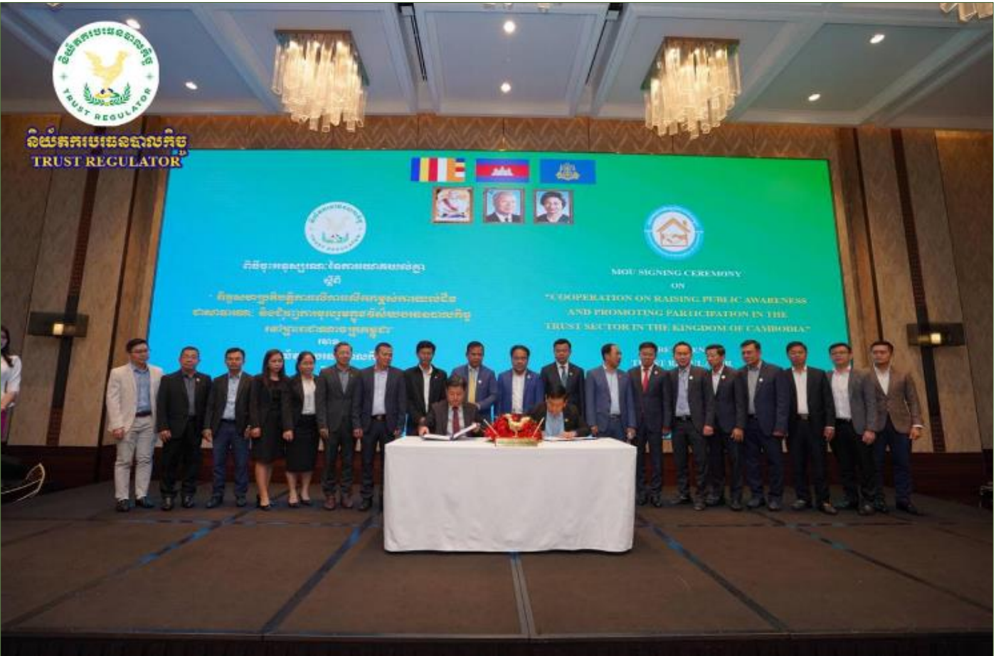
Picture: MoU between Trust Regulator with Housing Development Association of Cambodia.