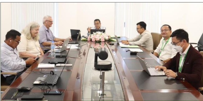
Picture: The technical meeting to discuss in detailed about the project mechanism and credit operations.