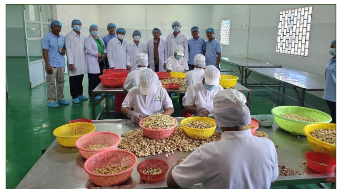
Picture: Mission to discuss with management and key staff of the Provincial Department of Agriculture, Forestry and Fisheries.