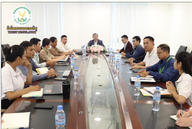
Picture: Meeting to review the work achievements of April 2023 of the Trust Registration Department.