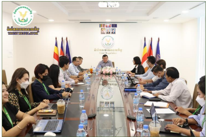
Picture: Meeting to review the achievements for April 2023 and action plans for May 2023.

officials of both departments. In this meeting, His Excellency Deputy Director General highly appreciated the achievements made in April, as well as praised the efforts and responsibilities of the leaders and officials of both departments and also offered recommendations for the upcoming month. The meeting ended with fruitful results and a high sense of responsibility.