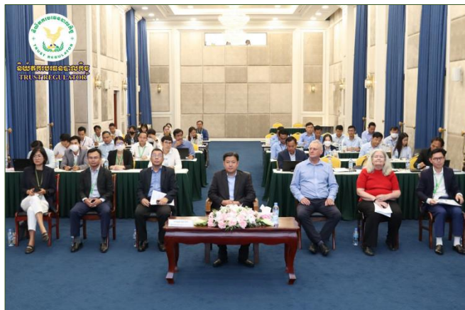
Picture: Dissemination workshop and capacity building program on "General Operation Guideline under Agricultural Value Chain Competitiveness and Safety Enhancement Project for Component 1".

This training is organized for the purpose of providing training in details about the Update of General Operating Guideline and the Credit Process for the working group of the Rural Development Bank and Agriculture and Sathapana Bank, the project partnered financial institutions, and the officers of the ACSEP/PIU1.