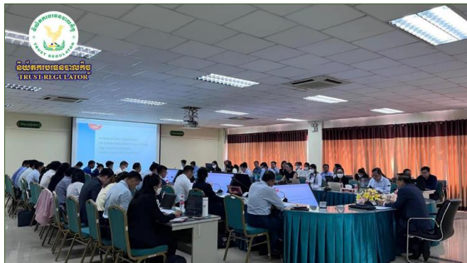
Picture: Meeting on Assessment of Legal Coordination and Beneficiaries (Sector 13).