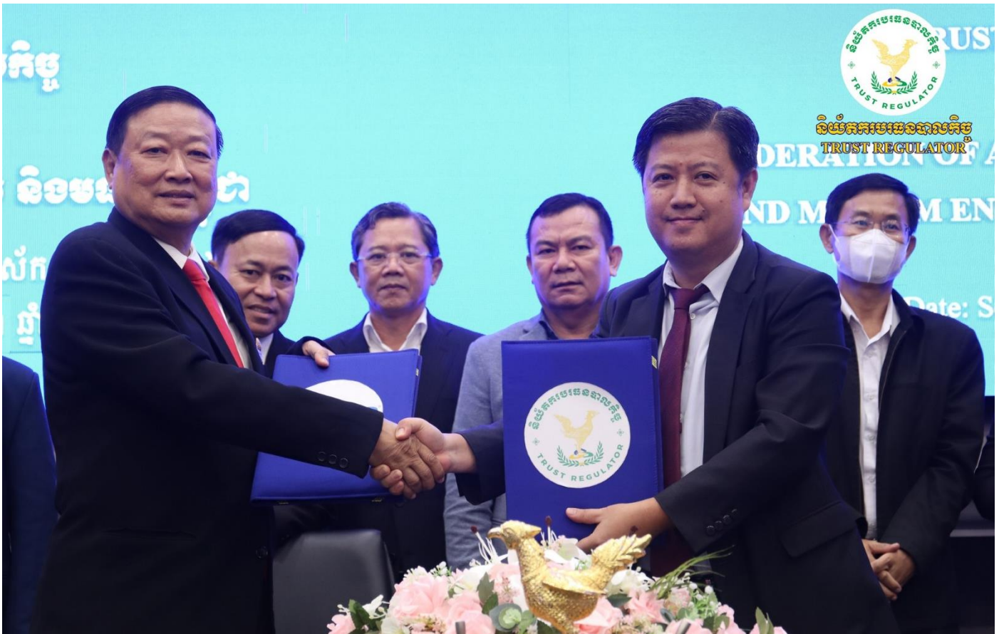
Picture of memorandum of Understanding (MOU) signing between Trust Regulator and Federation of Associations for Small and Medium Enterprises