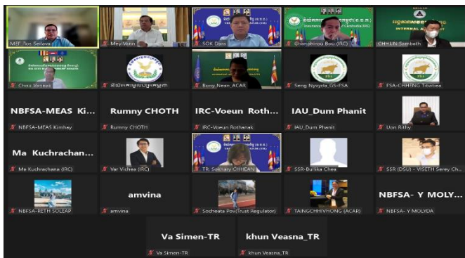
Picture of Meeting of the Non-Bank Financial Services Authority (FSA) to review “draft Gender Action Plan of Internal Audit Unit of the FSA for 3 years (2022-2024)”