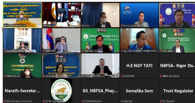
Picture of defending the draft "Action Plan for the Three-Year Rolling 2022-2024 and Action Plan 2022" of the TR at the 10th FSA meeting

Prime Minister, Minister of Economy and Finance and a Chairman of the FSA. This meeting was attended by the members of the FSA and the regulators in line the FSA via video conference (Zoom). As a result, the meeting endorsed the draft "Institutional Development Plan of TR for 5 Years (2021-2025)" of the TR.