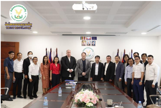
Picture of discussion meeting with delegates of DFDL

The purpose of this discussion meeting is to exchange ideas, experiences, and practical techniques, as well as to further understand about best practices of tax regimes related to the trust sector.