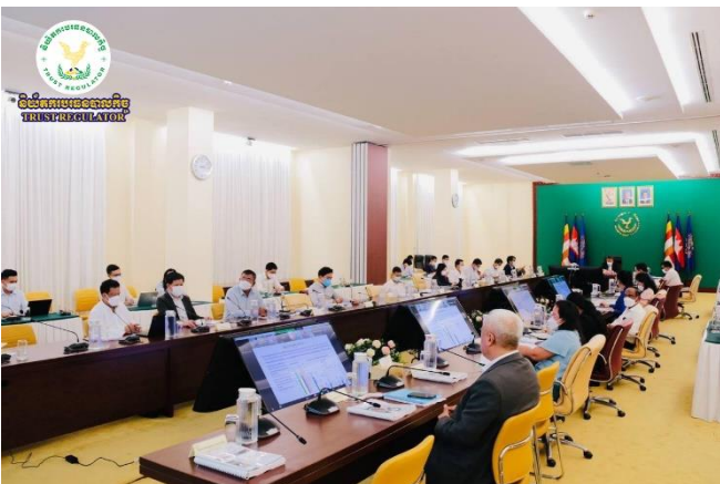
Picture of meeting on "Budget Implementation Review of Ministry of Economy and Finance (MEF) for the 1st Semester of 2022 "