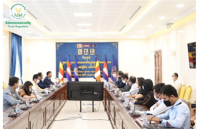
Picture of Meeting to discuss the feasibility study on the establishment of a working mechanism between the Non-Bank Financial Services Authority (FSA) with the Cambodia Chamber of Commerce