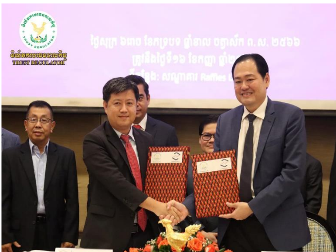
Picture of Memorandum of Understanding (MOU) signing between Trust Regulator and Zillennium Co., Ltd