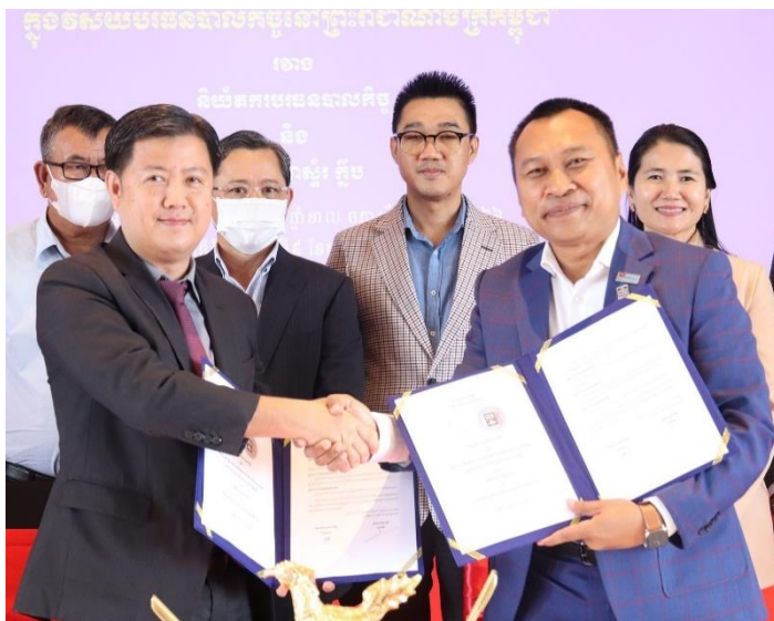
Picture of Memorandum of Understanding (MOU) between Trust Regulator and CEO Master Club