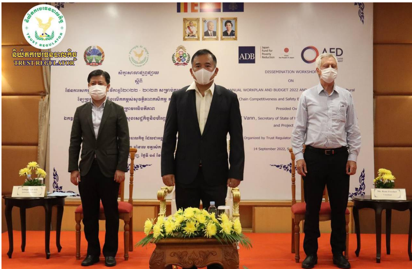
Picture of Dissemination workshop on Annual Work Plan and Budget 2022 (AWPB-2022) and AWPB-2023

members and national and international consultants of ACSEP/PIU 1, representatives from the General Department of International Cooperation and Debt Management of the MEF (MEF-GDICDM), representatives of the Asian Development Bank (ADB), representatives of the Project Management Unit of the Ministry of Agriculture, Forestry and Fisheries (MAFF-PMU), and representatives of Participating Financial Institutions.