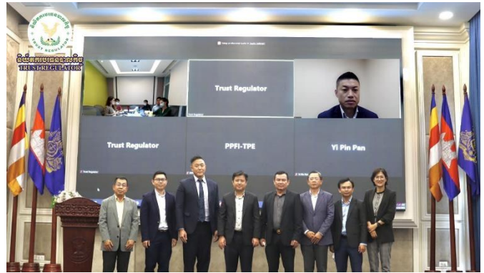
Picture of Seminar on "Best Practice Experiences Sharing and FinTech in Trust Sector"

The purpose of this seminar is to share the best practice experiences and FinTech in trust sector, with the presentation by the PPFI's speaker who has a great deal of experiences in terms of practice and operation technology.