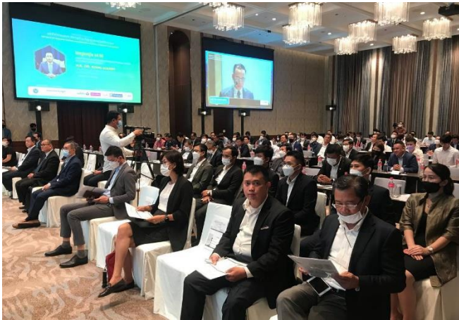
Picture of workshop on "The Role of Banking Sector and FinTech in Digital Economy in Cambodia"