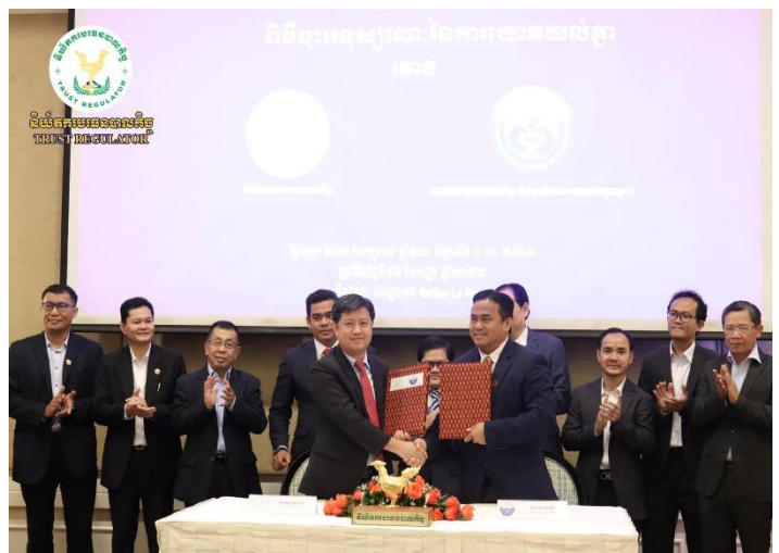
Picture of Memorandum of Understanding (MOU) signing between Trust Regulator and Cambodian Valuers and Estate Agents Association (CVEA)