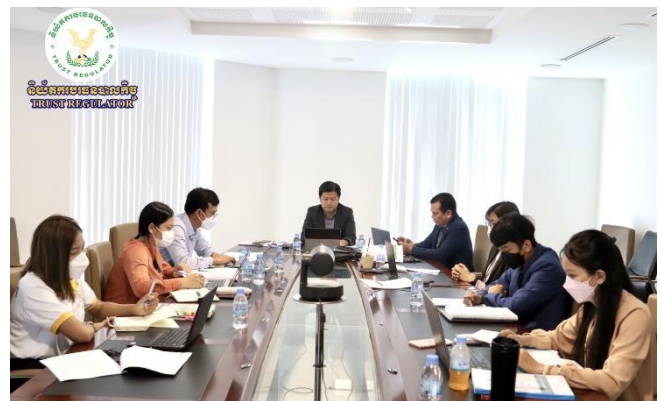
Picture of inter-regulator meeting of the Non-Bank Financial Services Authority