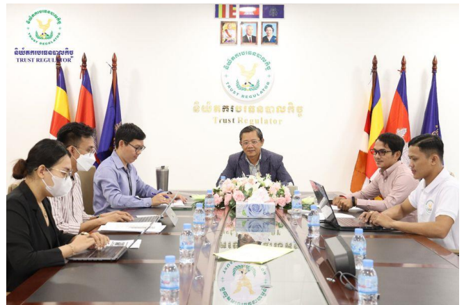
Picture of Inter-department meeting to review and discuss the progress of work related to the TR's website