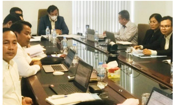
Picture of ACSEP meeting with National and International Financial Specialist Consultants