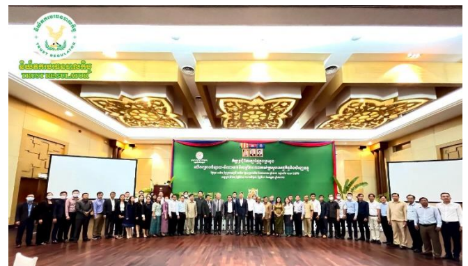
Picture of the internal ministry discussion meeting on Revenue and Expenditure Budget Plan for the Year 2023 of MEF