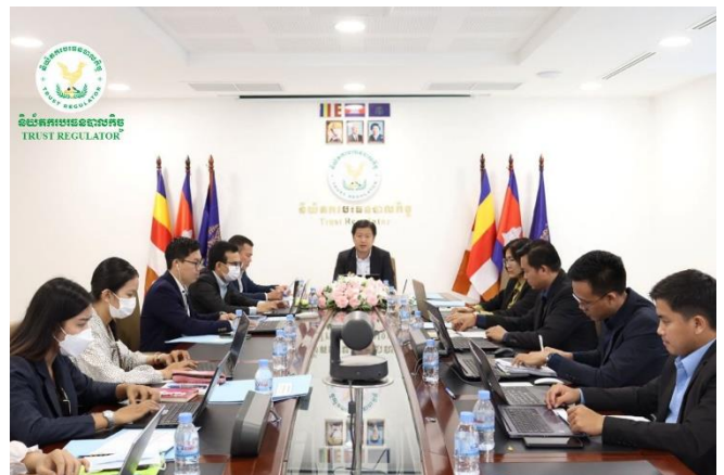
Picture of a workshop on “Reporting Entity’s Obligation and Property Frozen Reporting Form for Combating Financing of Proliferation of Weapons of Mass Destruction”