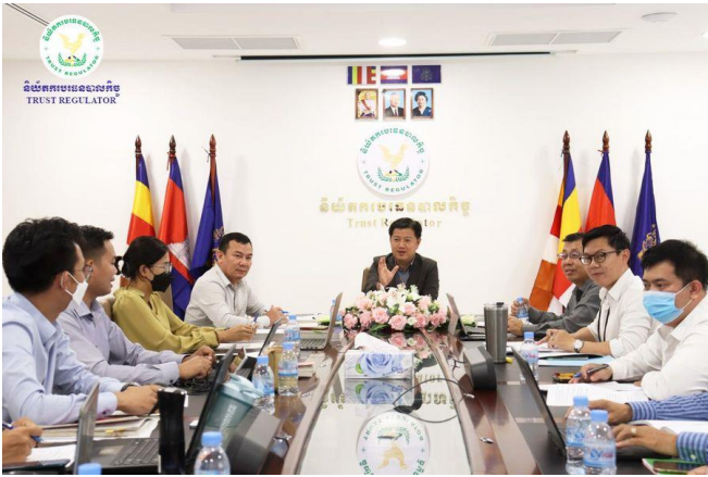
Picture of an inter-departmental meeting to Examine and discuss the draft prakas on the procedures of the Trust inspection.