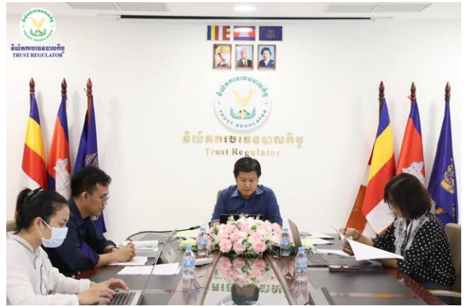
Picture of the Meeting to discuss on the Draft of Sub degree on Establishment of Agriculture Cooperative Development Fund