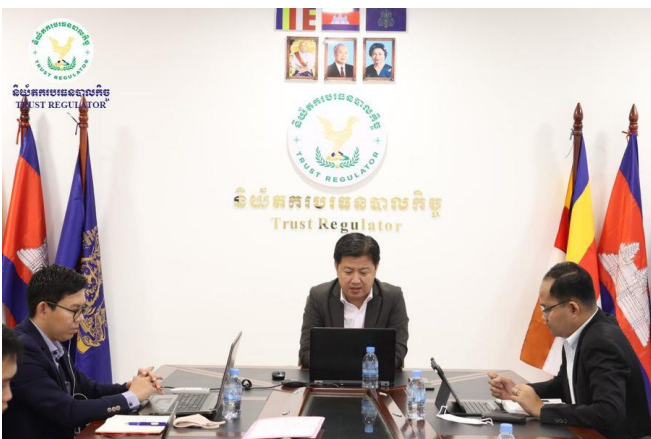
Picture of Virtual meeting with Management and Representative of Phnom Penh Fintech Investment Company to exchange