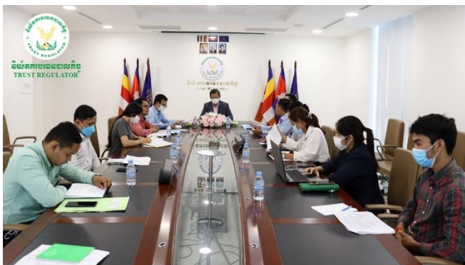
Picture of a meeting on Achievements of May 2022 and Action Plans for June 2022 of the Department of General Affairs

The meeting was ended with fruitful results and active spirit to complete next month's action plan.