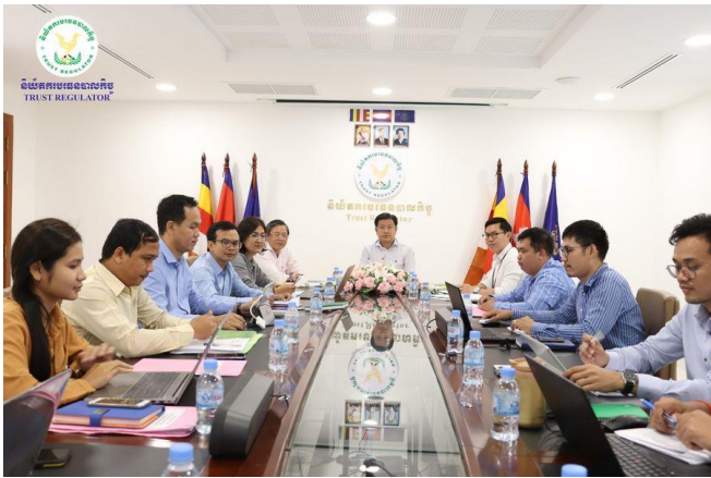
Picture of an inter-department meeting to review and discuss the Draft Prakas on Accreditation of Valuation Company in Trust Sector