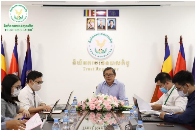
Picture of a meeting on Work Achievements for May 2022 and Action Plans for next months of the Department of Trust Registration