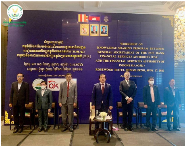
Picture of workshop on "Knowledge Sharing Program Between General Secretariat of the Non-Bank Financial Services Authority (FSA) and the Financial Services Authority of Indonesia (OJK)"