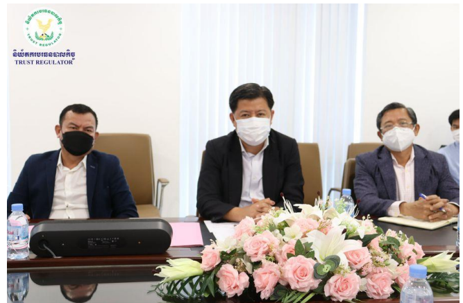
Picture of a meeting with the Internal Audit Unit of the Non-Bank Financial Services Authority