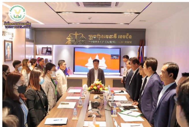
Picture: Training program on “Mechanism, Management, and Supervision on Trust”.