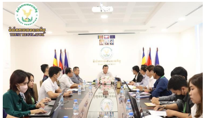
Picture: Inter-departmental meeting to review the achievements for May 2023 and action plans for June 2023.