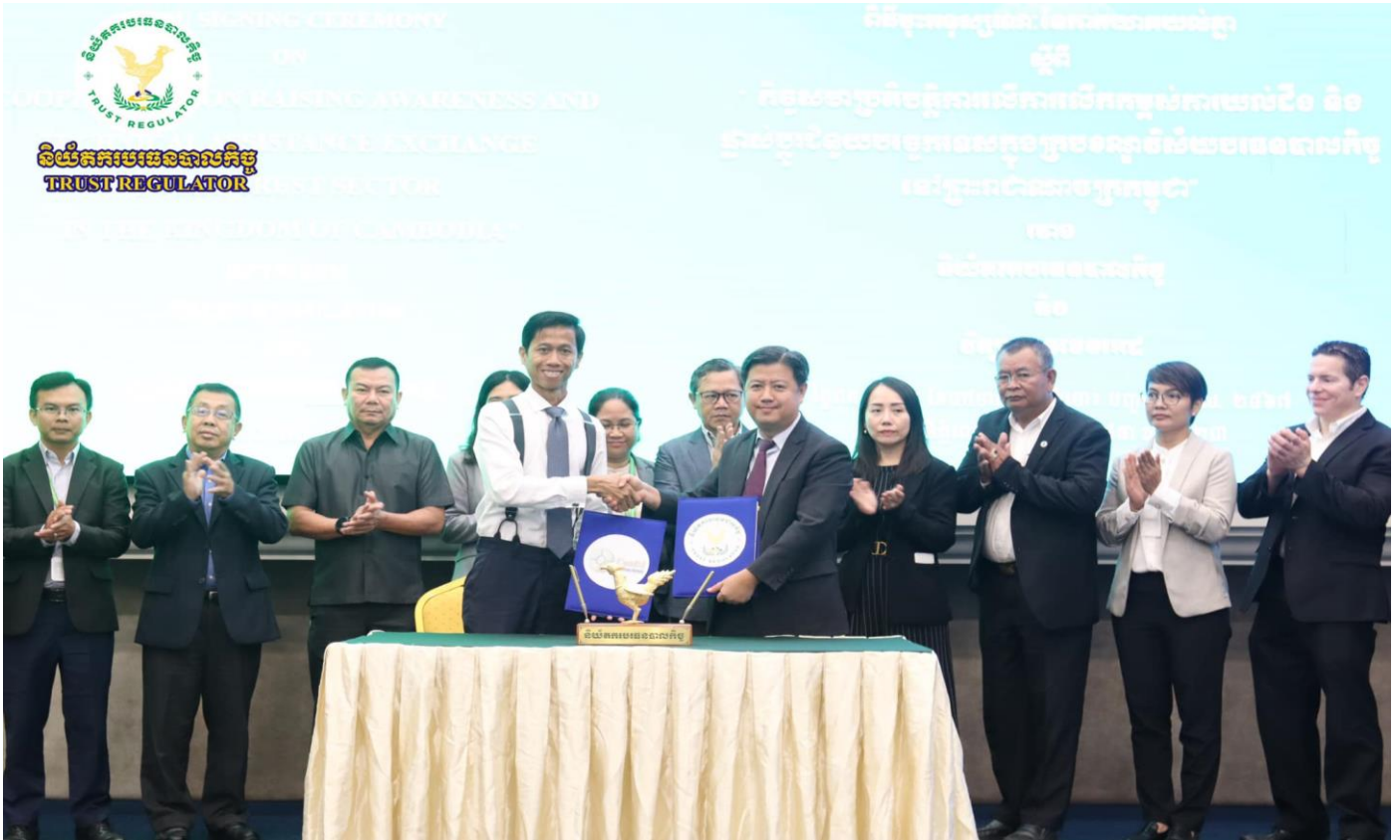
Picture: Memorandum of Understanding (MoU) concerning "Cooperation on Raising Awareness and Technical Assistance Exchange in the Trust Sector in the Kingdom of Cambodia".