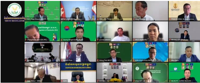
Picture: Meeting to review and discuss on Preparation of the draft of the Cambodia FinTech Development Policy.

This outreach workshop was also attended by leaders and representatives from institutions, departments, and units of the Svay Rieng Provincial Administration, members of the Chamber of Commerce, and related business associations, as well as representatives of trust companies, Commercial bank of the trustee operators providing retention and escrow services, valuation companies and independent individual trustees, and in the field of trust, which is licensed, authorized and accredited by the TR.