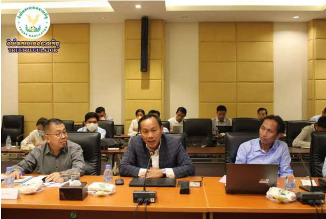
Picture: June 2023 Project Implementation Review Meeting.