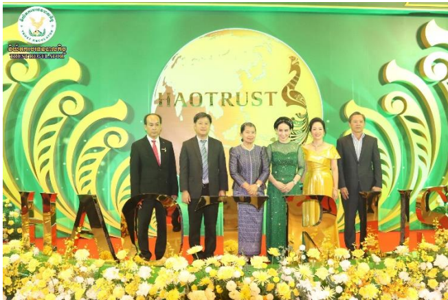
Picture: Grand Opening of HAOTRUST CAPITAL INVESTMENT CO., LTD.