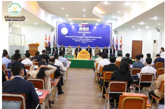
Picture: Dissemination workshop on "Legal Frameworks in Trust Sector".