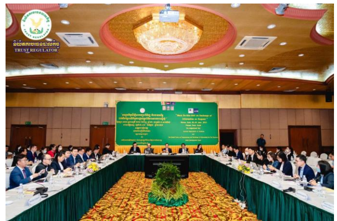
Picture: Inter-Ministerial-Institutional Meeting on “Mock On-Site visit on Exchange of information on Request”.