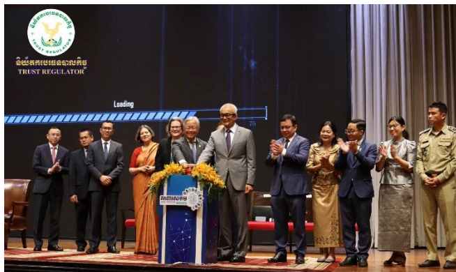
Picture: The Official Launch of the Registration and Data Management Systems Harmonization.