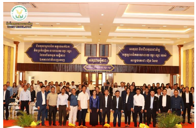
Picture: Dissemination workshop on "Legal Frameworks in Trust Sector".

This outreach workshop was also attended by leaders and representatives from institutions, departments, and units of the Koh Kong Provincial Administration, members of the Chamber of Commerce, and related business associations, as well as representatives of trust companies, Commercial bank of the trustee operators providing retention and escrow services, valuation companies and independent individual trustees, and in the field of trust, which is licensed, authorized and accredited by the TR.