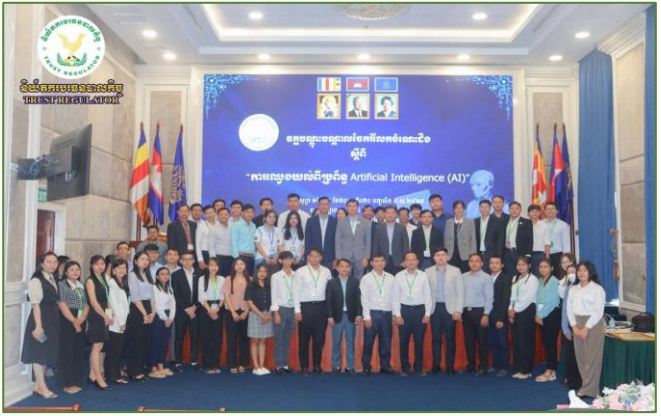
Picture: The training program on "Understanding about Artificial Intelligence (AI)".

Royal Government of the 7th Legislature of the National Assembly, and in order to learn about the processes, benefits and how to use of AI to facilitate in daily work performance, increase productivity, and get some of additional knowledge to contribute to the development of technology systems in the trust sector as well as the financial sector as a whole.