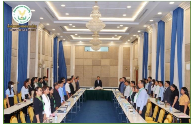
Picture: Quarterly Meeting to review the achievements for the Quarter 1 of 2024 and ongoing work direction.

implemented in the past time and suggestion to be better prepare for the next quarter of the year.