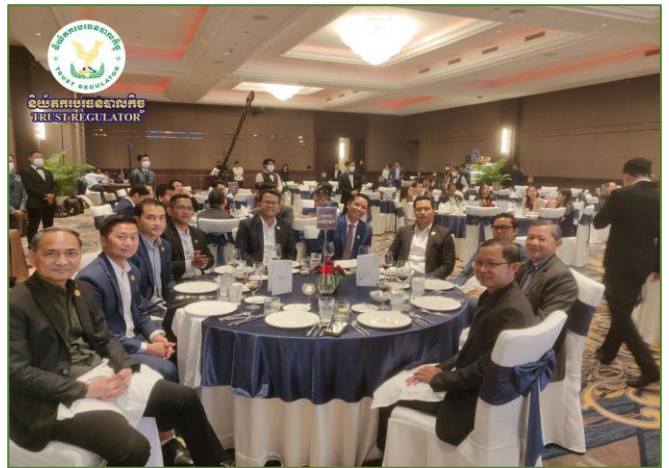
Picture: Banquet of 2023 work results meeting and work direction for 2024.