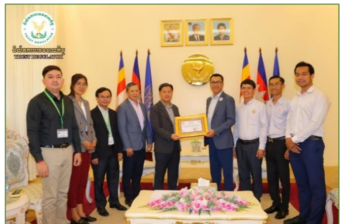
Picture: The TR's donations to the Kantha Bopha Cambodia Foundation.