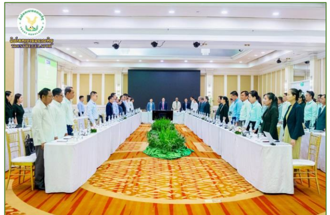
Picture: Workshop on a Draft book "Public Finance Management Reform for Structural Transformation: Fiscal Coordination between National and Sub-National Administrations in Cambodia"