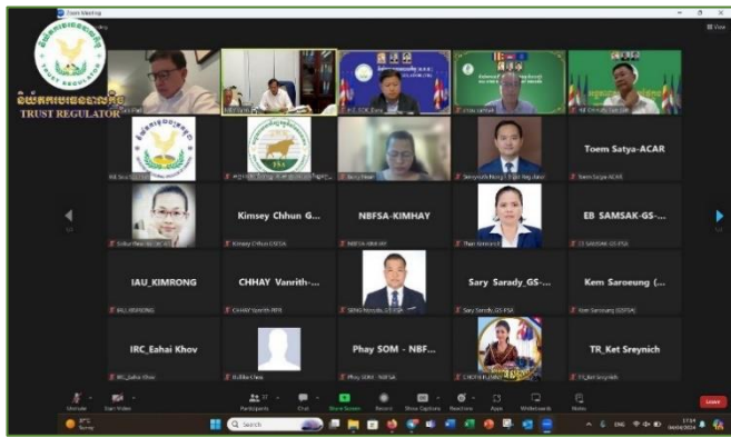
Picture: FSA technical meeting.