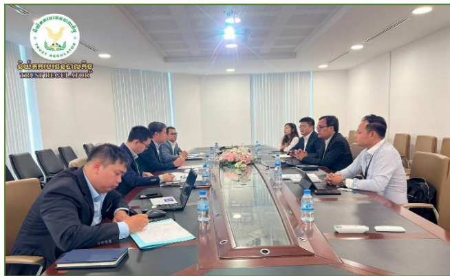
Picture: The meeting with V Connect Cambodia.