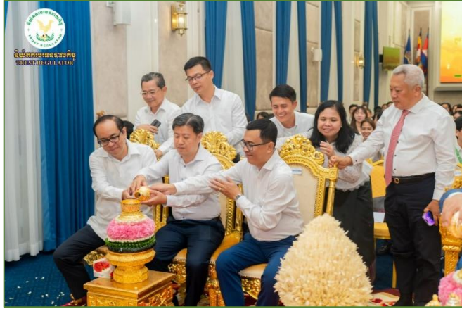
Picture: Ceremony to Celebrate Khmer New Year.

of Regulators under the FSA, His Excellency, Lok Chumteav, Ladies and Gentlemen who are the managements and Officials of the Regulators and Unit under the FSA.