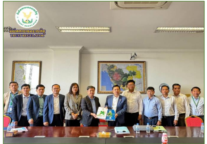
Picture: The meeting with the Ministry of Environment.