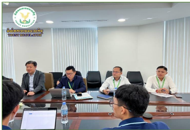
Picture: The meeting with Cloudnet Cambodia.