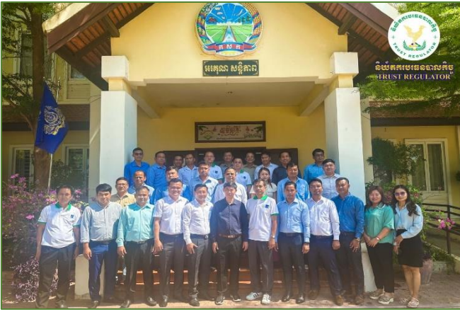
Picture: Training on completing the environmental and social impact information form - ESMS Info.Sheet.