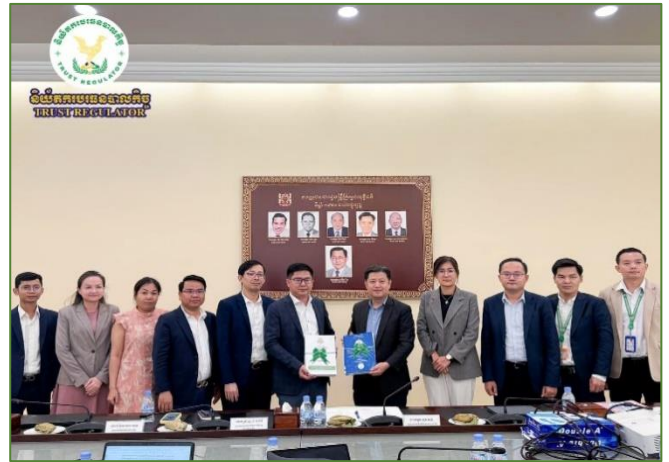
Picture: The meeting with the Ministry of Environment.

The meeting focused on the institutional development framework, the legal and regulatory framework in force, the promoting and strengthening law enforcement, and possible cooperation in the framework of dispute resolution, training and outreach, as well as other cooperation between the Ministry of Justice and the Trust Regulator.