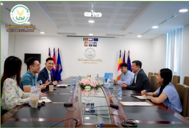
Picture: Meeting with the Cambodia Footwear Association.