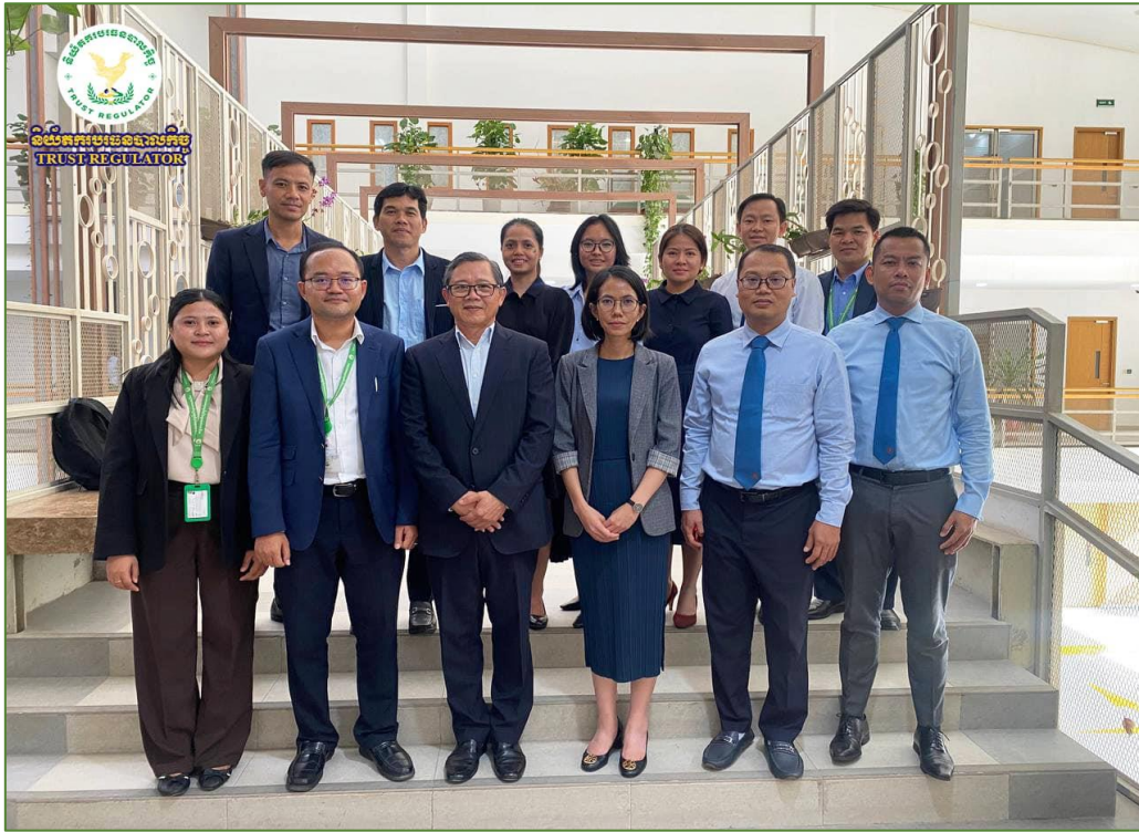
Picture: The meeting with the National Bank of Cambodia.